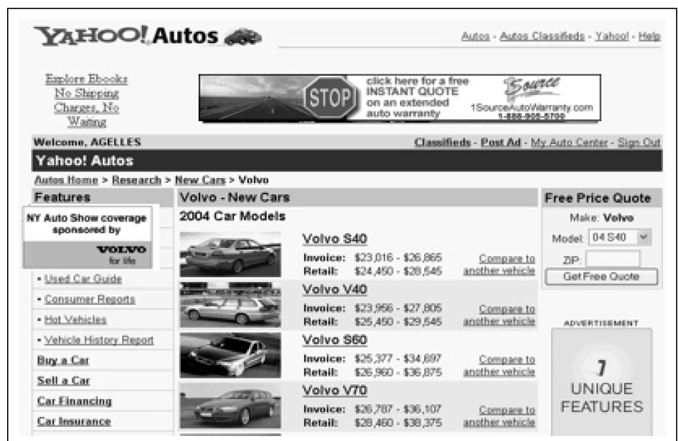
Figure 2 Common Sponsorship