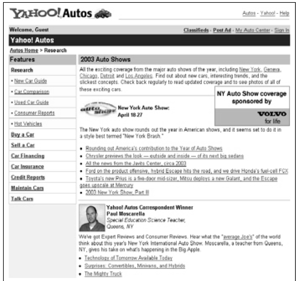
Figure 1 True Sponsorship

In this study the lift in Willingness to Consider Volvo was compared between the two forms of sponsorship. Of course,